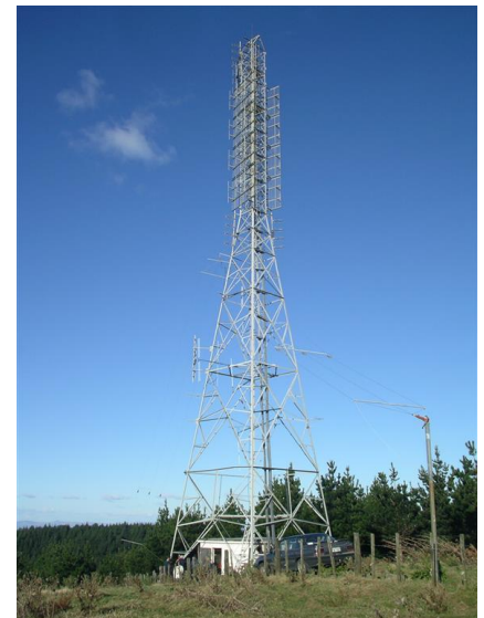
Klondyke Tower Auckland another H&S challenge

Health & Safety is as simple as: STOP – THINK – PLAN and then ACT Look at the back of your ID Card